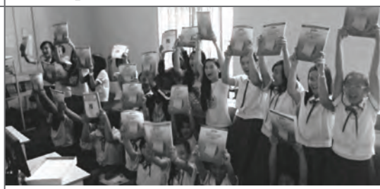
Baguio Central School

A Private/UC Initiative for Resource Assistance to Public Entities