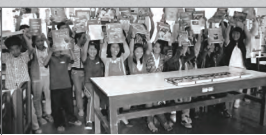
Alejo N. Pacalso Memorial National High School