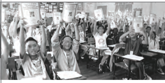
Lucban Elementary School