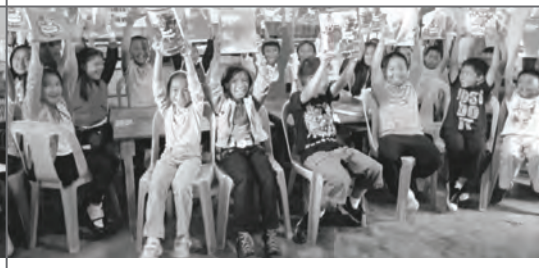
Jose P. Laurel Elementary School