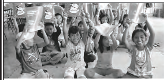
Springhills Elementary School