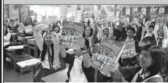
Baguio City National High School