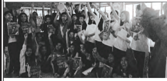
Pines City National High School