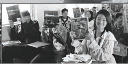
Joaquin Smith National High School